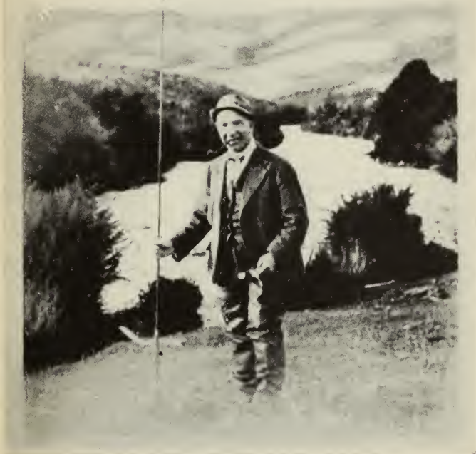
TROUT FISHING ON THE MINNEHAU, SOUTH ISLAND, NEW ZEALAND